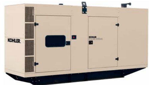
With Available Enclosure Accessory